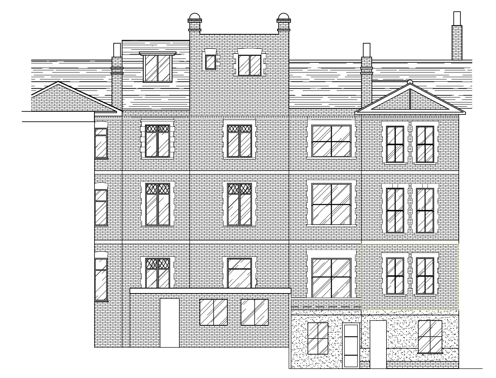
Existing South (Rear) Elevation Scale 1:100 @ A1